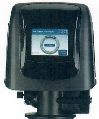
5800XTR-2 Clock, Meter or Backwash Control