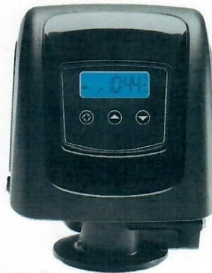
5800SXT Clock, Meter or Backwash Control