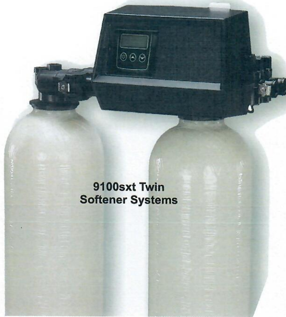
9100sxt Twin Softener Systems