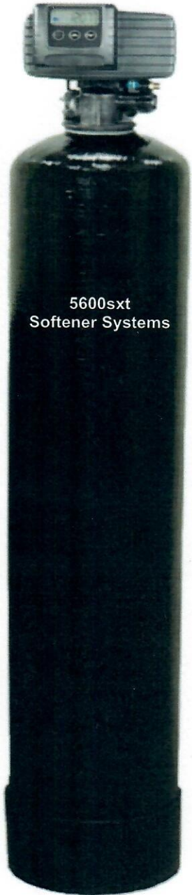
5600sxt Softener Systems

INTERNATIONAL WATERWORKS inc. E-Mail us @ iwaterworks@aol.com Please visit our web site @ www.iwaterworks.com PRICES SUBJECT TO CHANGE WITHOUT NOTICE