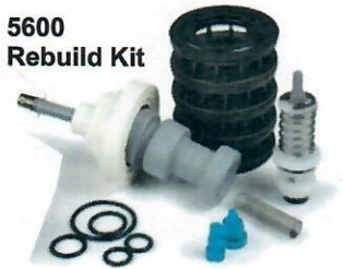
5600 Rebuild Kit