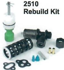
2510 Rebuild Kit