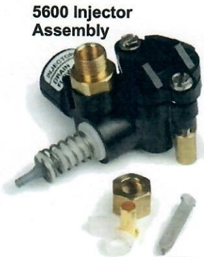
5600 Injector Assembly