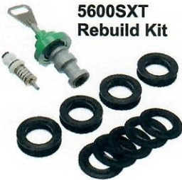
5600SXT Rebuild Kit