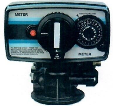
5600 Meter Control