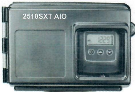
2510SXT AIO Air Injection Control