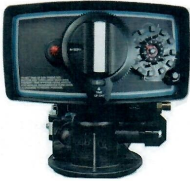
5600 Clock or Backwash Control