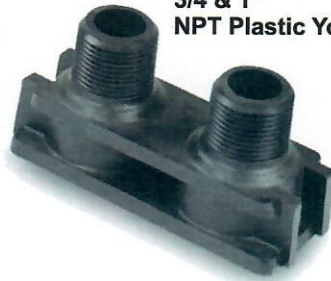
3/4 & 1" NPT Plastic Yokes