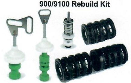
900/9100 Rebuild Kit