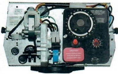
2510 Clock or Backwash Control