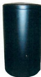
18x40" Brine Tank 450 Salt Cap

ALL BRINE TANKS INCLUDE 2310 SAFETY, FLOAT, #500 AIR CHECK SALT GRIDS ARE OPTIONAL.