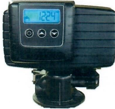
5600SXT Clock, Meter or Backwash Control