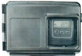
2510SXT Clock, Meter or Backwash Control