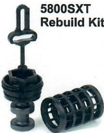
5800SXT Rebuild Kit