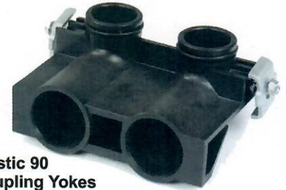
Plastic 90 Coupling Yokes