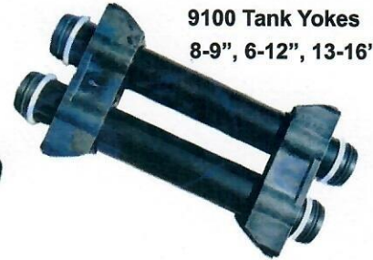
9100 Tank Yokes 8-9", 6-12", 13-16"