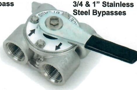
3/4 & 1" Stainless Steel Bypasses