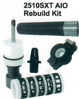
2510SXT AIO Rebuild Kit