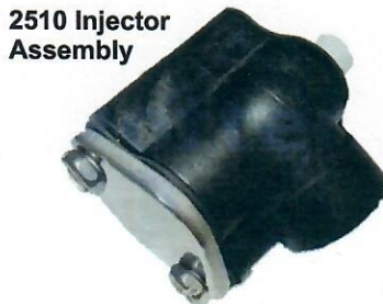
2510 Injector Assembly