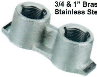
3/4 & 1" Brass and Stainless Steel Yokes