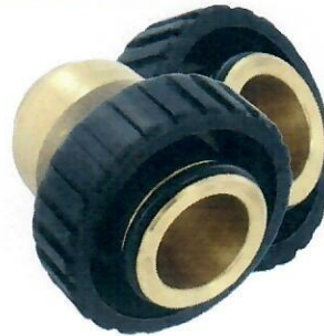
WS1/WS125, 3/4, 1, 1.25/1.5" Brass Adapters