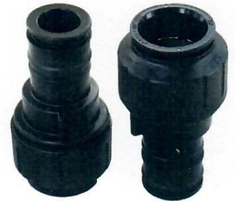
WS1/WS125, 3/4, 1" John Guest Adapters