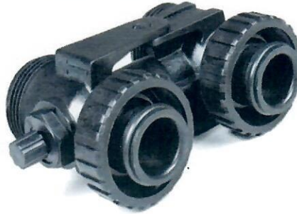
WS1/WS1.25 Hard Water Bypass