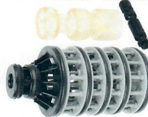
WS1/WS1.25/1.5" Rebuild Kits