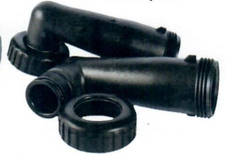
WS1/WS1.25 Vertical Adapters