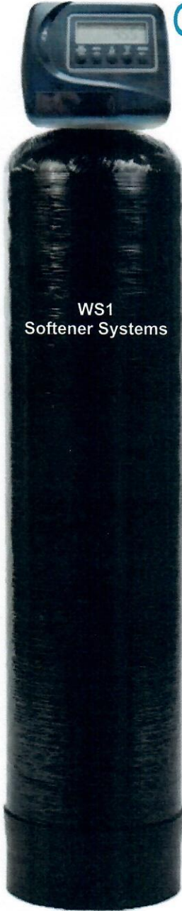
WS1 Softener Systems