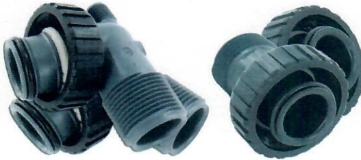
WS1/WS1.25 Assorted PVC Adapters