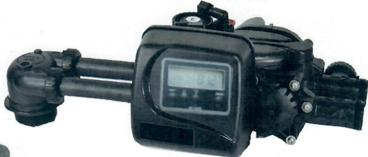
WS1EE Twin Control