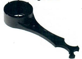
WS1 Cage Tool