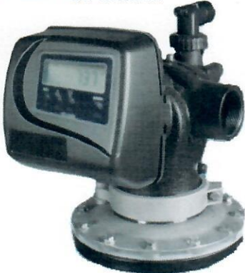
WS2EE QC Control