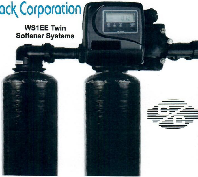
WS1EE Twin Softener Systems