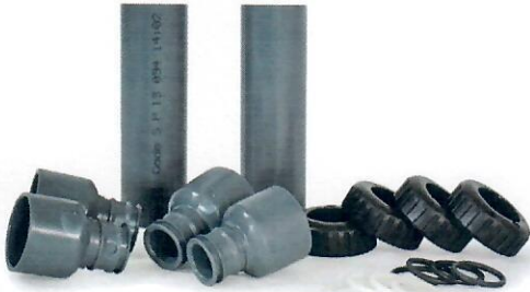
WS1 Twin 12-21" Tank Yoke Assembly