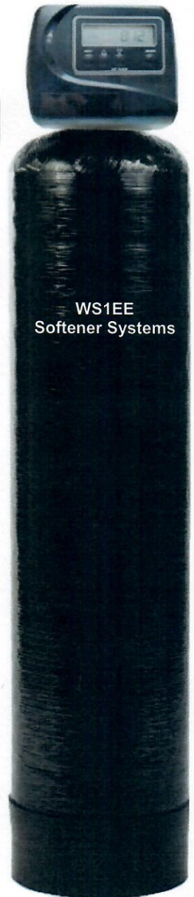
WS1EE Softener Systems

Optional Bypass, Plumbing Adapters and Tank Jackets