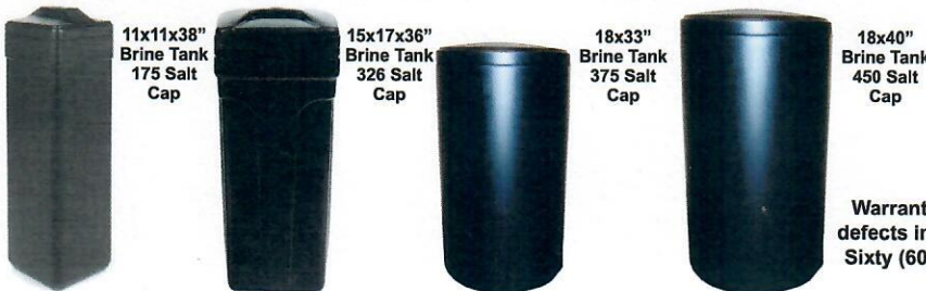
11x11x38" Brine Tank 175 Salt Cap