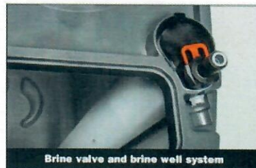
Brine valve and brine well system