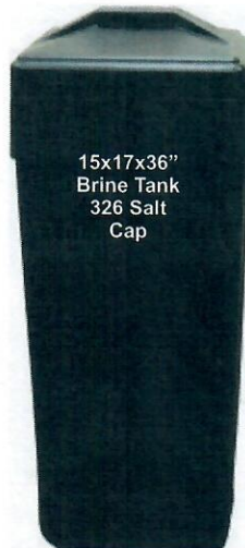
15x17x36" Brine Tank 326 Salt Cap