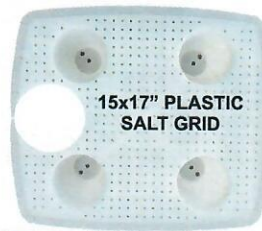
15x17" PLASTIC SALT GRID