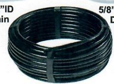
5/8"OD x 1/2"ID Drain Line Tubing