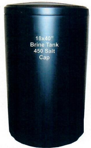
18x40" Brine Tank 450 Salt Cap

ALL BRINE TANKS CAN BE PURCHASED AS A COMPLETE ASSEMBLY