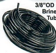
3/8"OD x 1/4"ID Brine Line Tubing