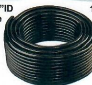
1/2"OD x 3/8"ID Brine & Drain Line Tubing