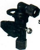
2310 3/8" SAFETY SHUT-OFF