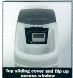
Top sliding cover and flip up access window

CALL YOUR IwwI REPRESENTATIVE FOR PRICING AND AVAILABILITY