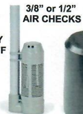
3/8" or 1/2" AIR CHECKS