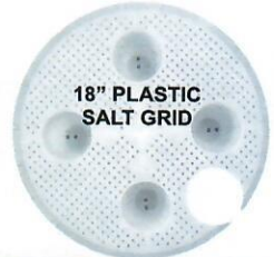
18" PLASTIC SALT GRID