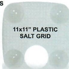
11x11" PLASTIC SALT GRID