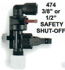
474 3/8" or 1/2" SAFETY SHUT-OFF

ALL BRINE TANKS CAN BE PURCHASED AS A COMPLETE ASSEMBLY