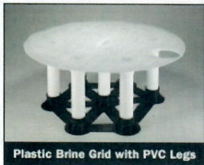
Plastic Brine Grid with PVC Legs