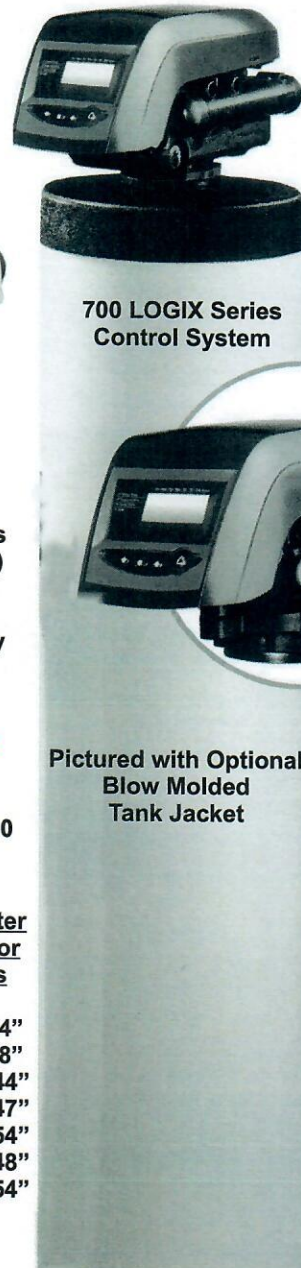
700 LOGIX Series Control System