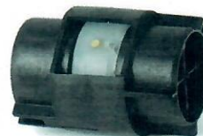
268/269 Meter Assembly

AUTOTROL (PENTAIR) LIMITED WARRANTY Warrants that all products it sells will be free from defects in materials and workmanship for a period of Sixty (60) months from date of shipment. Copies Of Warranty Are Available