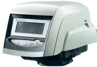
269 Up-Flow Series Control System

269 Up-Flow Series System Comes In 2 Sizes 40K-1.25cf (10x44" Tank) 48K-1.5cf (10x54" Tank) Includes a 15x17" Brine Tank w/2310 Safety No Salt Grid.