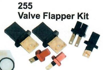
255 Valve Flapper Kit