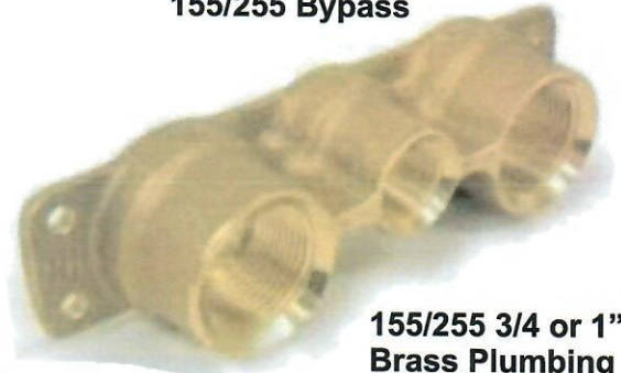
155/255 3/4 or 1" Brass Plumbing Adapter