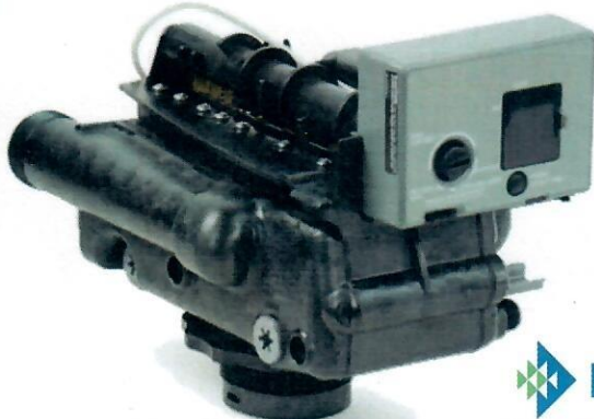
268/460TC & 268/460i Clock Control Meter Control