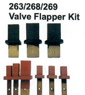
263/268/269 Valve Flapper Kit