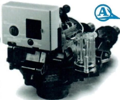
255/460TC & 255/460i Clock Control Meter Control