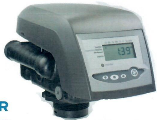
268/740/742 & 268/760/762 Clock Controls Meter Controls