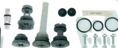
255/263/268/269 Spare Parts