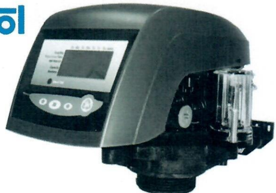
255/740/742 & 255/760/762 Clock Controls Meter Controls