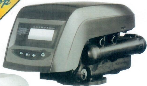
263/740/742 Backwash Clock Backwash Control