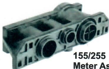
155/255 Meter Assembly