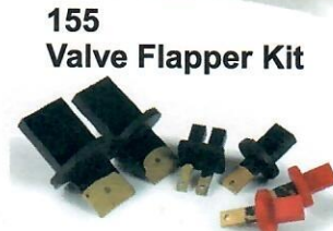
155 Valve Flapper Kit