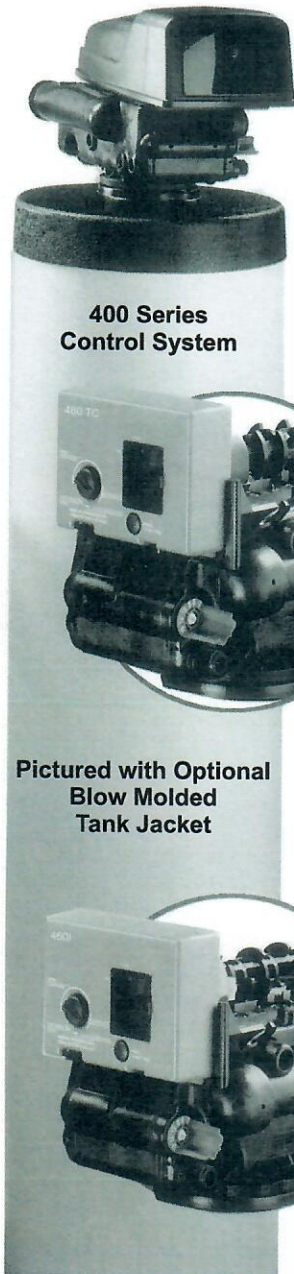
400 Series Control System