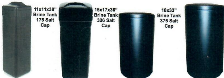
11x11x38" Brine Tank 175 Salt Cap