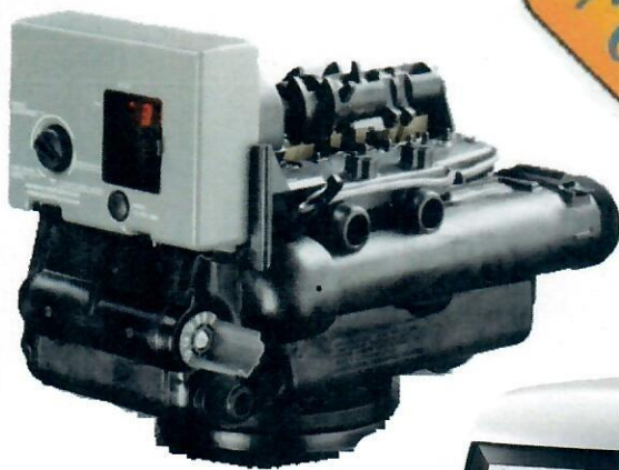
263/460TC Backwash Clock Backwash Control