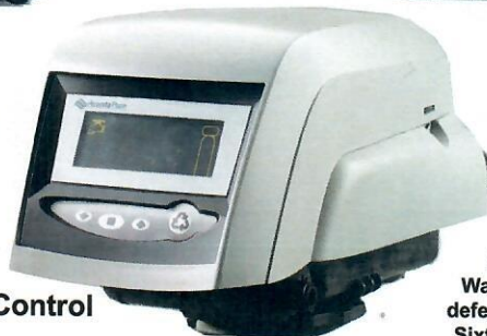
269/869 Up-Flow Control Meter Control

AUTOTROL (PENTAIR) LIMITED WARRANTY Warrants that all products it sells will be free from defects in materials and workmanship for a period of Sixty (60) months from date of shipment. Copies Of Warranty Are Available