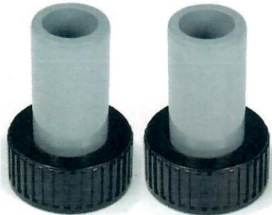
3/4 or 1" PVC Plumbing Adapters