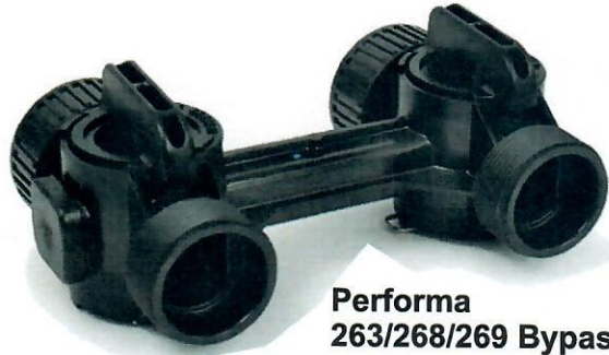
Performa 263/268/269 Bypass